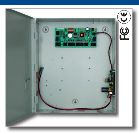
URC-2002 includes one URC-2000 controller installed in an ENCL-1-PS enclosure as shown above