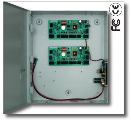
URC-2004 includes two URC-2000 controllers installed in an ENCL-1-PS enclosure as shown